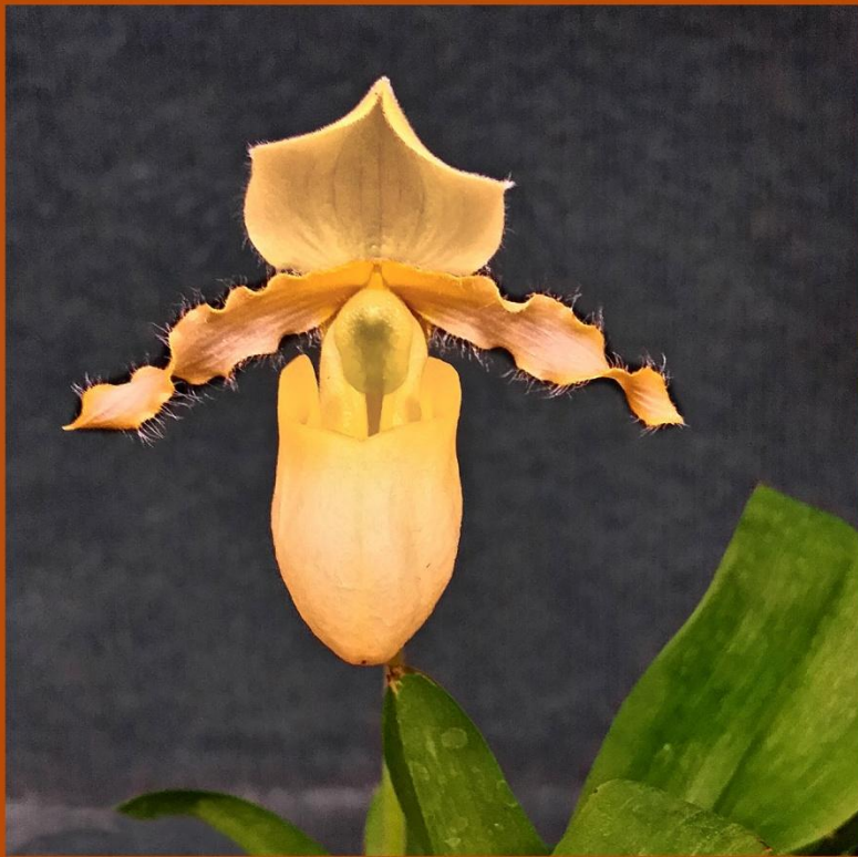
Paph primulinum flavum Dallis Church Best Newbie Award